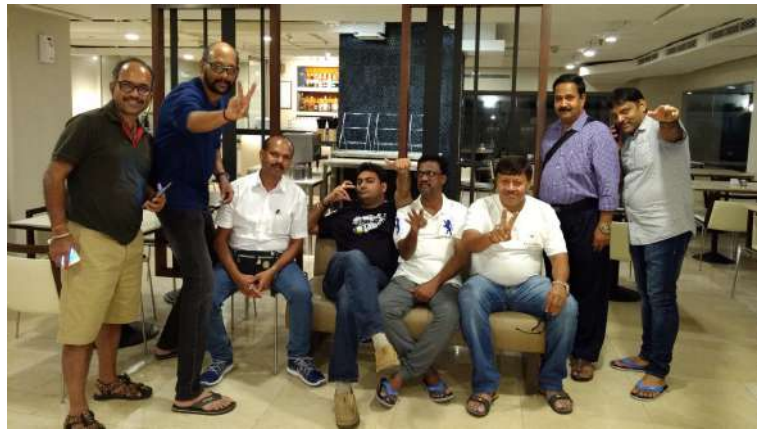
On 28th July, eight of our Rotarians toured to Bangkok on a Cultural and Study tour. It was a 5 day tour during which they visited two Rotary Clubs in Bangkok.